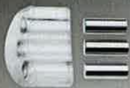
Tuned Weight Cartridge

It's the longest, hottest COR, longest, most forgiving,